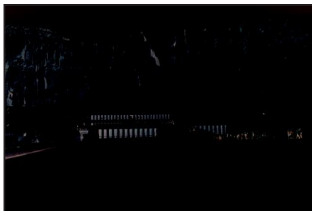
Temple of Hapshepsut, Dier el-Bahari

Register free for your future issues of this geological and landscape conservation magazine: www.earthheritage.org.uk