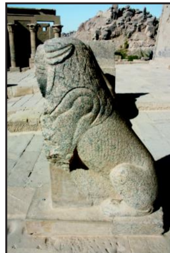
Aswan: Lion statue made of crystalline rock

You can support the GEOTREX project by contributing your ideas, worksheets, schemes of work, other teaching resources or more KMZ files to supplement Google Earth Extras and streetview. Please submit items by email to: webmaster@esta-uk.net with the subject GEOTREX