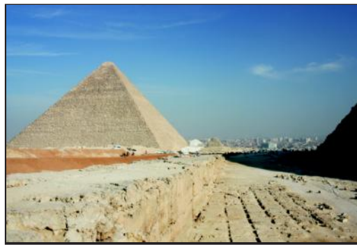
Giza: Pyramid of Khufu

Do send photographs for the next newsletter to the Editor at hiatus@liv.ac.uk