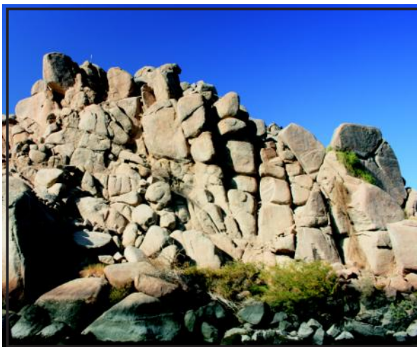
Spheroidal weathering of granite

Shell London Lecture: Earth's Atmosphere Trapped in Ice: 800,000 Years of Climate Change The Geological Society, Burlington House. Piccadilly, London, W1J 0BG Contact: www.geolsoc.org.uk/shelllondonlectures11