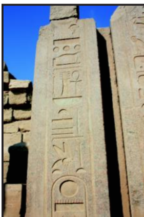
Luxor: inscription cut in granite

If you can help, email: webmaster@esta-uk with the subject BOARDS. (ESTA will pay your travel expenses)