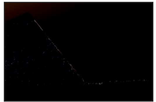
Giza: Pyramid of Khafre capped by Tura Limestone