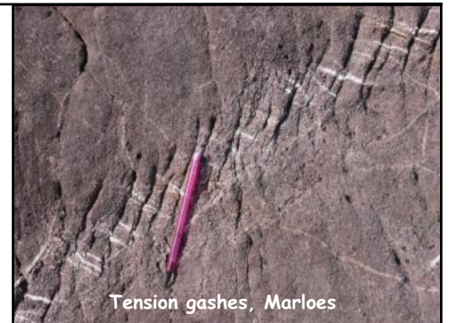
Tension gashes, Marloes