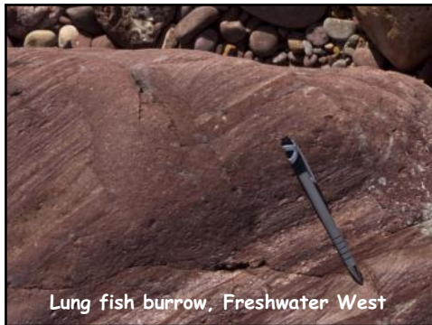
Lung fish burrow, Freshwater West

ESTA News 5.1 also includes information about this year's ESTA Course and Conference , which will be hosted by Plymouth University on 27 th - 29 th September. This meeting, sponsored by the Petroleum Exploration Society of Great Britain (PESGB), promises to be an excellent event, providing opportunities to meet enthusiasts from Plymouth University, the National Marine Aquarium, Plymouth City Museum, English Riviera Geopark and the Jurassic coast.