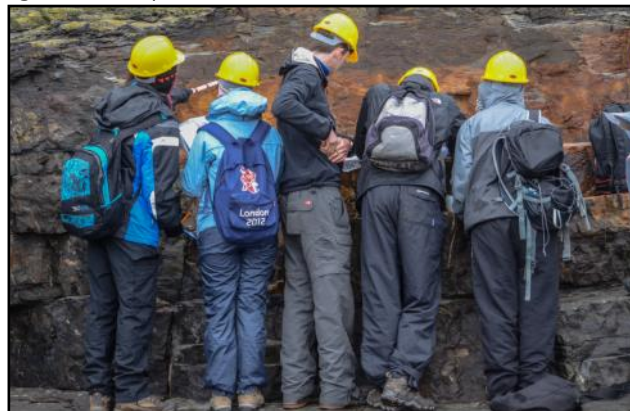
Fieldwork in the rain at Amroth

This report explains how salt causes chalk cliffs to collapse.