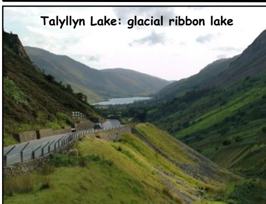
Tallylyn Lake: glacial ribbon lake

Applications are invited for these prizes. Essentially the prizes are awarded for fieldwork in NW England/ North Wales or for fieldwork anywhere undertaken by individuals or groups from universities, schools or colleges based in NW England or North Wales. Details available from Joe Crossley. Liverpool Geological Society: lgshonsec@gmail.com