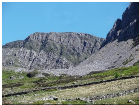
Sill exposed on north face of Cadair Idris

Here BGS hosts the websites of 52 geoscience organisations.