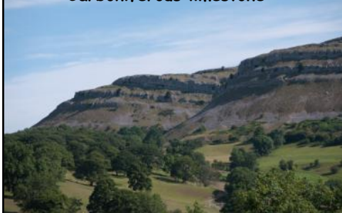
Eglwyseg escarpment: Carboniferous limestone