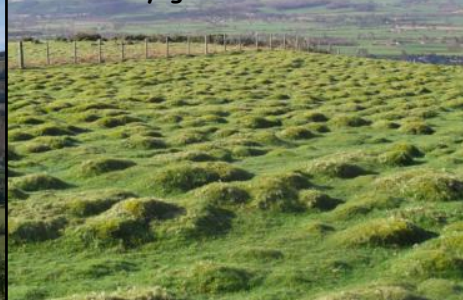
Moel Llys y Coed: cryogenic mounds