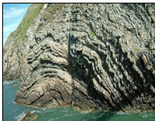
Folds at South Stack