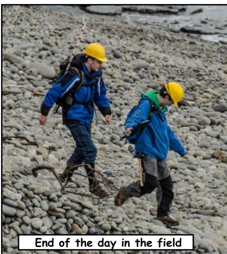
End of the day in the field