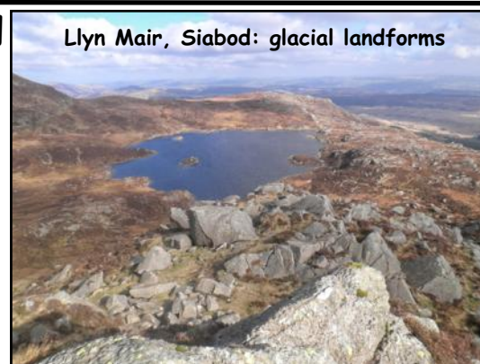
Llyn Mair, Siabod: glacial landforms

Northern Geological Supplies (Limited) wish to give ESTA members 10% off all products purchased via: http://geologysuperstore.com/ Under the heading 'Discount Codes' type in: geosoc001 and click the 'apply coupon' button.