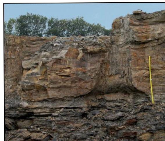
Lycopods in growth position, Brymbo