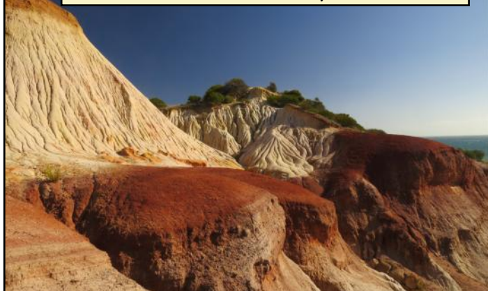
Hallet Cove Conservation Park, South Australia