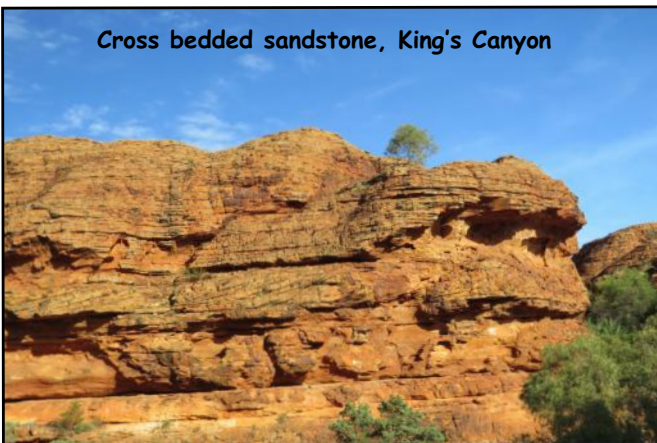
Cross bedded sandstone, King's Canyon

Australia's longest single river is the River Murray. It is 2,375 kilometres long.