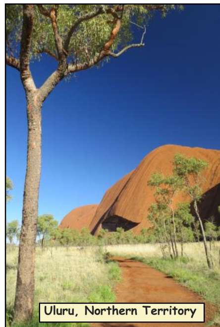
Uluru, Northern Territory

www.geolsoc.org.uk/Policy-and-Media/Resources/Earthquakes