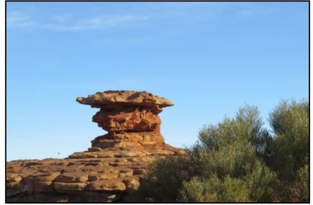
Rock pedestal, King's Canyon