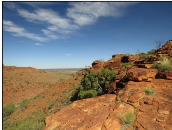
The King's Canyon.