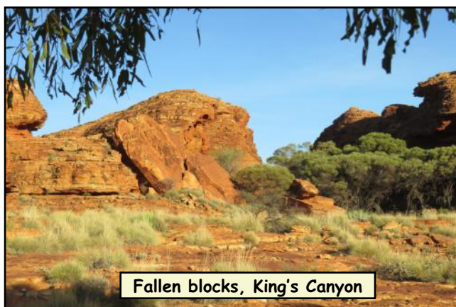
Fallen blocks, King's Canyon

http://phys.org/news/2015-04-scientists-deeper-yellowstone-magma.html