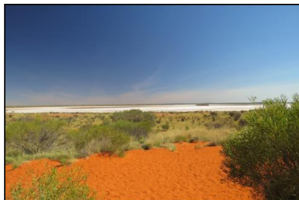
Right >> Salt lake, Red Centre Way, Northern Territory