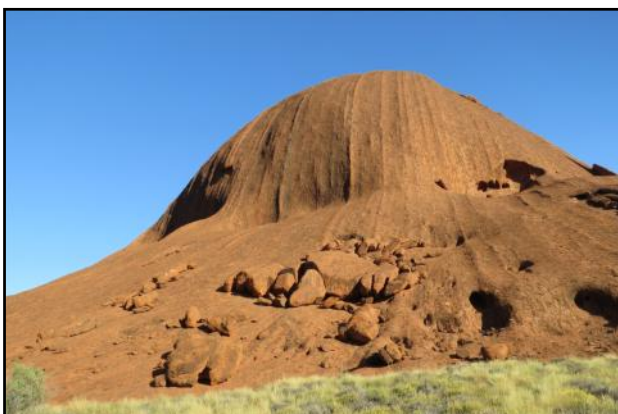
<< Left Uluru - massive sandstone monolith in the heart of the Red Centre desert, Northern Territory