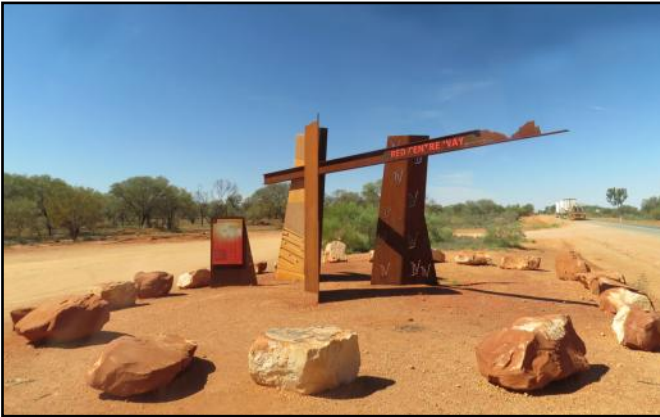
Red Centre Way sign